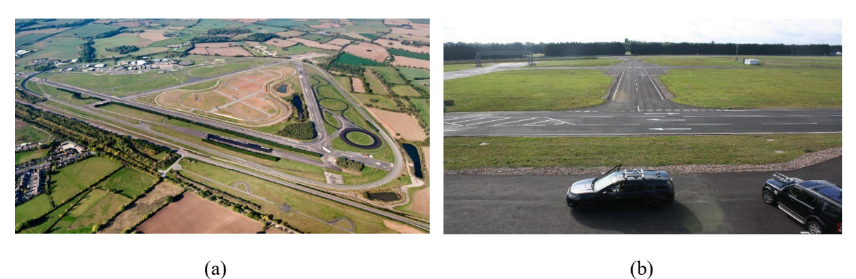
Figure 1: Pictorial representation of the test area. (a) Google Map plan view. (b) Panoramic photo.

The measurement site is located on Horiba MIRA test track, Nuneaton, U.K. A Google Map plan view of the trials site is shown in Figure 1 (a) and the panoramic photo of the test area is shown in Figure 1 (b).